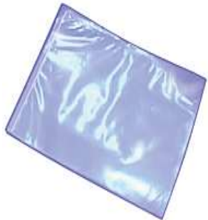
(1) B1290-00 CLEAR PACKING ENVELOPE